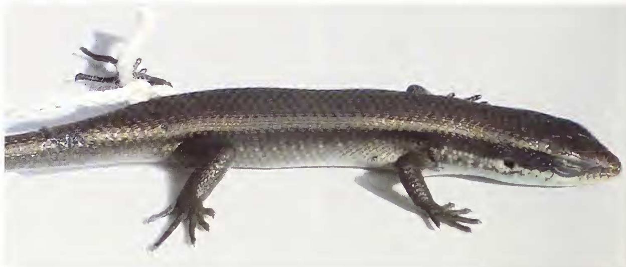
Fig. 12. Eutropis cf. rudis from Salibabu Island. Photo by André Koch.

& ALCALA (1980) in having 20 and 22 keeled lamellae under fourth toe, 32 and 30 midbody scale rows (usually 28–30, rarely 31 or 32; 28–31 in E. rudis from Sulawesi according to HOWARD et al. [2007]), respectively. A postnasal is present. The hind limbs of MZB Lac. 5142 reach the axilla as postulated by DE ROOIJ (1915), while MZB Lac. 5113 exhibits tricarinate dorsals as typical for E. rudis . The second specimen's dorsal scales have up to five keels (very rarely in E. rudis according to BROWN & ALCALA [1980]), of which the three medians are strongly pronounced and flanked by two feeble outer keels. The Talaud specimens share this character with the newly described E. grandis from Sulawesi (HOWARD et al. 2007), from which, however, they are clearly distinguishable by higher midbody scale counts (30–32 vs. 25–27 in E. grandis ). In contrast to BROWN & ALCALA (1980) and HOWARD et al. (2007) both vouchers have 40 paravertebral rows (vs. 34–38 in Philippine E. rudis and 34–35 in Sulawesian E. rudis , respectively) between parietals and base of tail. The dorsal side is brown, laterally with a dark brown streak starting behind the nostrils, bordered above by a light brown streak; ventral side light grey, supralabials also grayish. In specimen MZB Lac. 5113 the ventral side is light gray only on the first half of the body; the rest including hind limbs and tail is brownish.